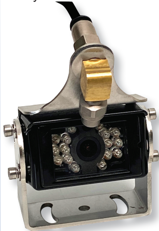
System Shown Installed on C4F136

Product Specification - The SmarTruck HD Part No C22AW2 Dual Camera SmartWash™ Camera Airwash System provides a convenient way to clear water, dust and debris from the camera system without leaving the safety of the vehicle's cab. The SmartWash system is 100% comprised of US-made military-grade components for long-term durability, quality, and functionality.