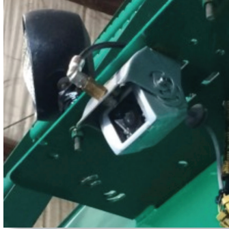
Compressed Air Removes Water and Grime from Camera